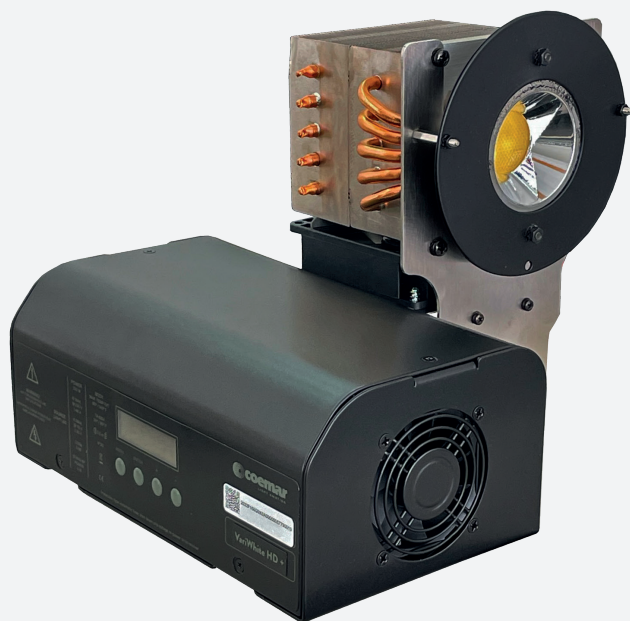
ReLite LED Kit for DeSisti Leonardo 2K