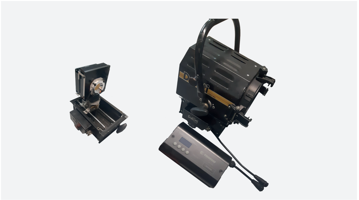
ReLite LED Kit for DeSisti Leonardo 1K